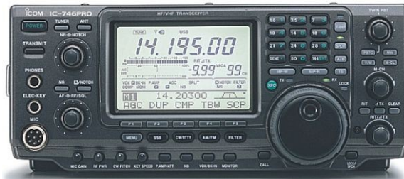
Many of our members use modern equipment like this Icom 746Pro transceiver.